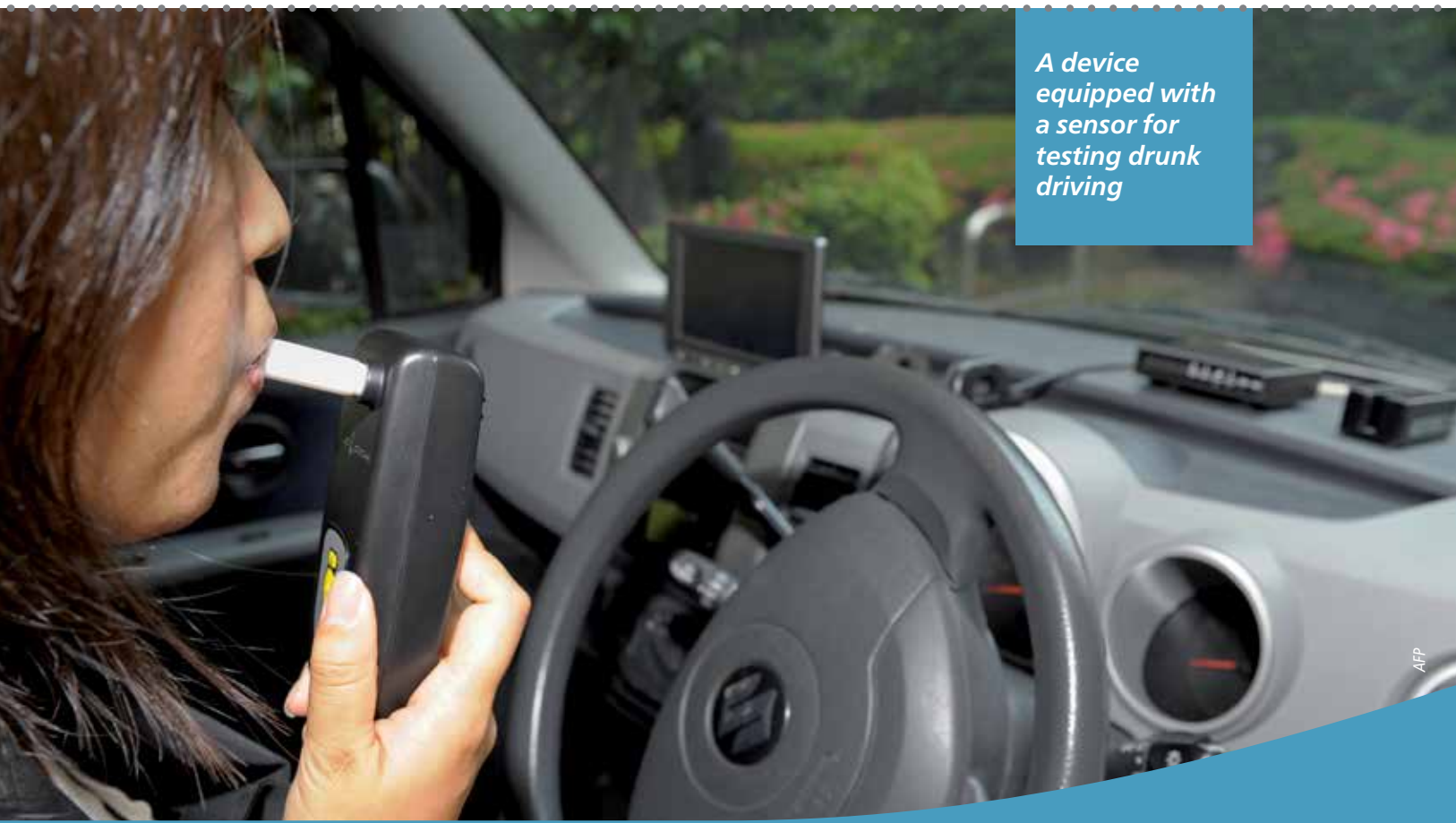
A device equipped with a sensor for testing drunk driving

and safety of vehicles and road infrastructure. The programme does not introduce any new prescriptions. It focuses on more effective application of the rules and standards already in force. In this regard, there are five categories of measures to be implemented in several stages by 2015.