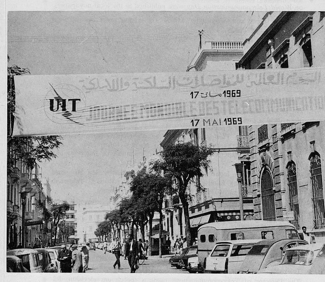
At Tunis on 17 May 1969