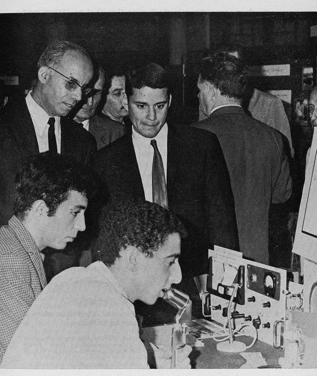
Algiers — Amateur radio sets shown in operation