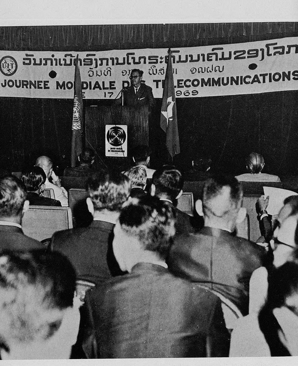
The ceremony on 17 May 1969 at Vientiane