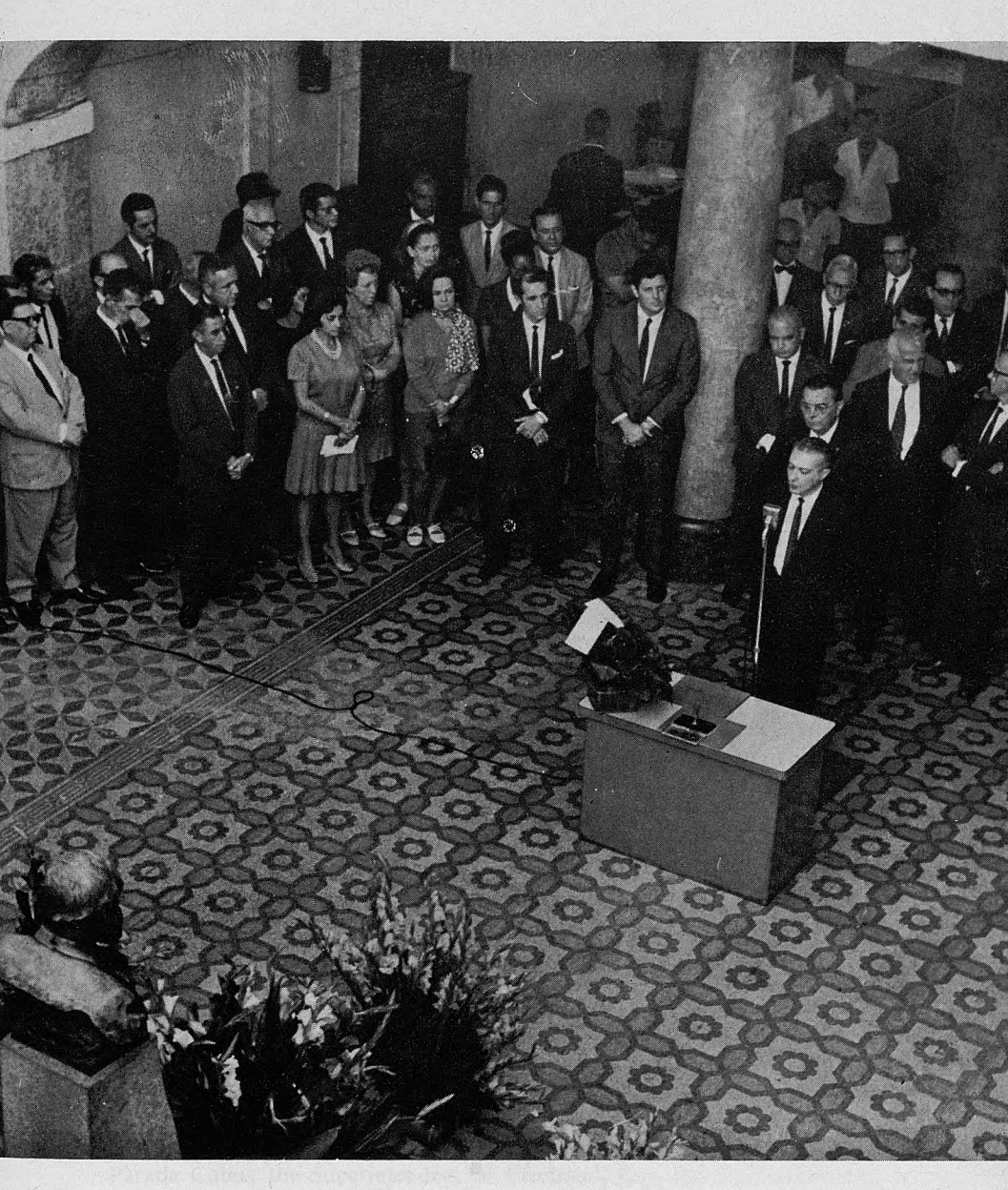
Ceremony before the bust of Baron Capanema, Brazilian patron of telecommunications